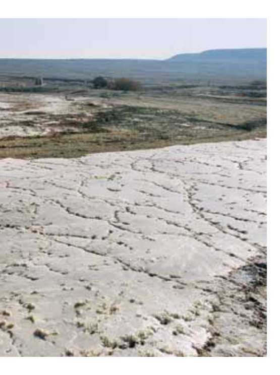
Photos : (Left) Dead Sea water level has fallen by approximately 25 meters in less than 50 years. (Below) Boy washing hands, Amman, Jordan.