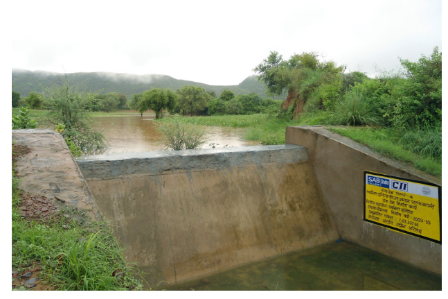
Above: Recharge Structure and local farmer.

These combined interventions have reduced the recharge gap by 32% to 40 000 000 m<sup>3</sup>/year. Further actions to bridge the gap will be necessary. These may include construction of more recharge structures and the promotion of precision farming techniques based on the concepts of soil moisture management and plant growth management.